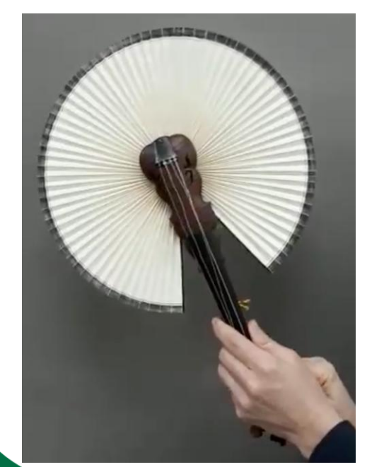
One special pochette in the Royal College of Music has a secret.

Pull a cord, and a fan pops out of a hidden compartment in case the performer gets too hot!